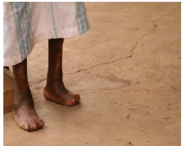
Fig 1. Picture of a person with Hansen disease(Hansen's disease)

The basic concepts behind rehabilitation are that the persons affected with Hansen disease should be restored back to normal social life or as near as possible. Rehabilitation means restoration of economic productivity leading to economic independence. In India economic independence outweigh many other considerations. Rehabilitation in the field of Hansen disease requires greater efforts than the rehabilitation in other types of disabled persons because the question of social acceptance does not arise in non-Hansen disease disabled persons. In the case of a orthopedically handicapped or a blind or deaf person their stay with the family is not prejudiced as in the case of Hansen disease patients. This is due to the stigma attached to the disease. Therefore our paper is a step towards restoring their normal live. Being known the virulence of this disease, most of the research is based on its cure. Some of the existing treatments include drug therapy and chemotherapy. Also steps are being taken to eradicate and to a larger extend control its spread. A step towards rehabilitation is yet to catch up its pace. The main objective of this paper is to design a glove for Hansen diseased patients in order to alert them in case of any physical parameter extremity such as pressure or temperature using an inbuilt sensor network and a data acquisition system for storing the information acquired from the sensor for further analysis.