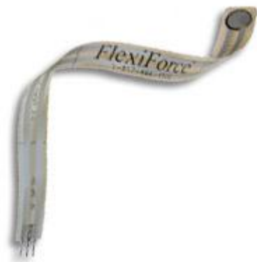
Fig 3. Flexi force Sensor