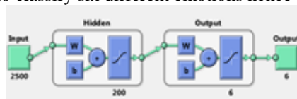
Fig: Neural network used

Once the dataset is created the next step is to select the neural network. It means we need to decide about input layer, hidden layer and output layer. For our work, we have used 50*50 images it means our input layer consist of 2500 features. We have used 200 hidden layer and since we want to classify six different emotions hence our output layer consist of 6 classes.