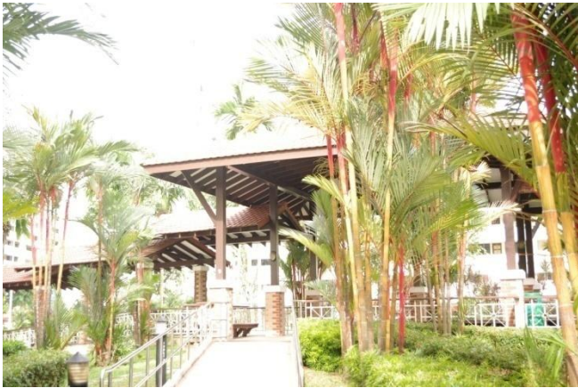
Fig 8: All the shadow details are correctly captured

In the third step HDR algorithm tries to find the over exposed regions. In the over exposed region pixel values are close to 255. Once the algorithm finds the over exposed regions, it tries to find the correct exposure values. By decreasing the shutter speed we can correctly capture the highlight details. Once the camera identifies the correct exposure values