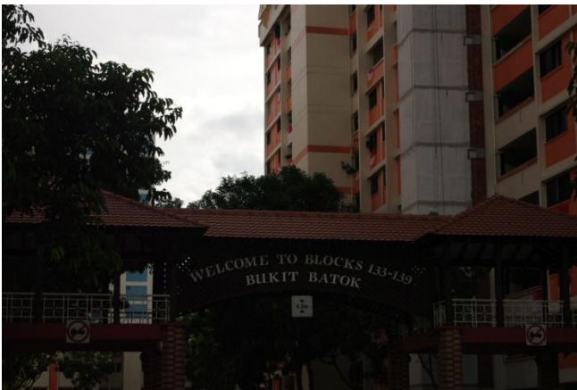
Fig 1: Image captured with shutter speed 1\3200 sec

In general dynamic range refers to the ratio between the maximum and minimum measurable light. For an imaging sensor dynamic range dynamic range refers to the ratio between full well capacity and noise. Naturally scene's dynamic range can be up to 100,000 and the sensor dynamic range is always less than that.