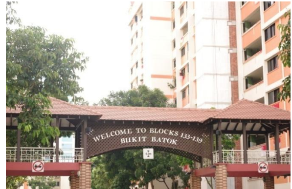
Fig 2: Image captured with shutter speed 1\50 sec

We can clearly observe that the figure 1 darker and the figure 2 is brighter. In the figure 1 background details are clearly visible and in the figure 2 the tree details are correctly visible.