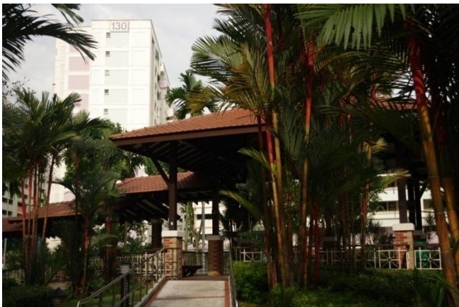
Fig 9: All the highlight details are captured

In the third step HDR algorithm tries to find the over exposed regions. In the over exposed region pixel values are close to 255. Once the algorithm finds the over exposed regions, it tries to find the correct exposure values. By decreasing the shutter speed we can correctly capture the highlight details. Once the camera identifies the correct exposure values