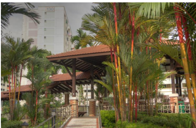
Fig 10: Fused image

We fused all the above three images and the result is displayed in the Figure 10. We can clearly observe that all the high light details and shadow details are captured.