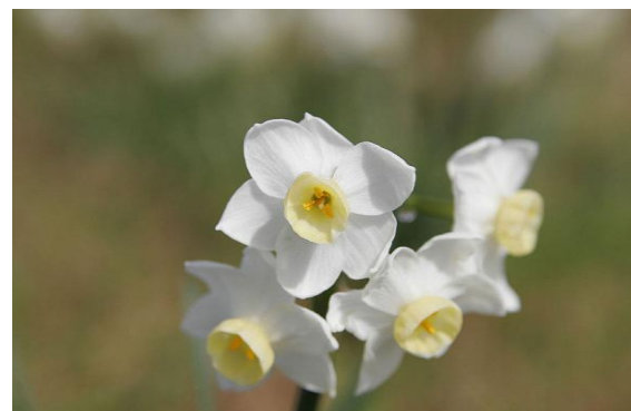
Fig 4: Image captured with F#-5

We can also change the exposure values by changing the f-number. Figure 3 and 4 are captured with different f-numbers and different shutter speed values. We can clearly see that background is unfocused. During the fusion phase these details will be completely not useful. Hence we preferred to change the shutter speed values. Both figure 3 and 4 are collected from Wikipedia.