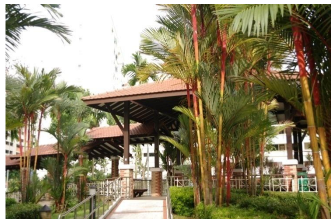
Fig 7: Image captured with auto mode

Our algorithm basically consists of four parts. In the first part the end user should capture the image with the exposure settings suggested by the digital camera. Currently most of the digital cameras come up with the auto mode. If the user selects auto mode then automatically camera suggests shutter speed, aperture, ISO for a given scene. Once the camera suggests the exposure values, based on the exposure values suggested by the camera the end user captures a photograph.