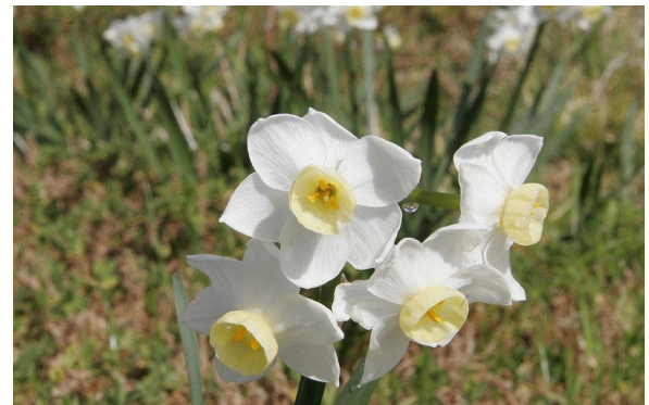
Fig 3: Image captured with F#-32

We can also change the exposure values by changing the f-number. Figure 3 and 4 are captured with different f-numbers and different shutter speed values. We can clearly see that background is unfocused. During the fusion phase these details will be completely not useful. Hence we preferred to change the shutter speed values. Both figure 3 and 4 are collected from Wikipedia.