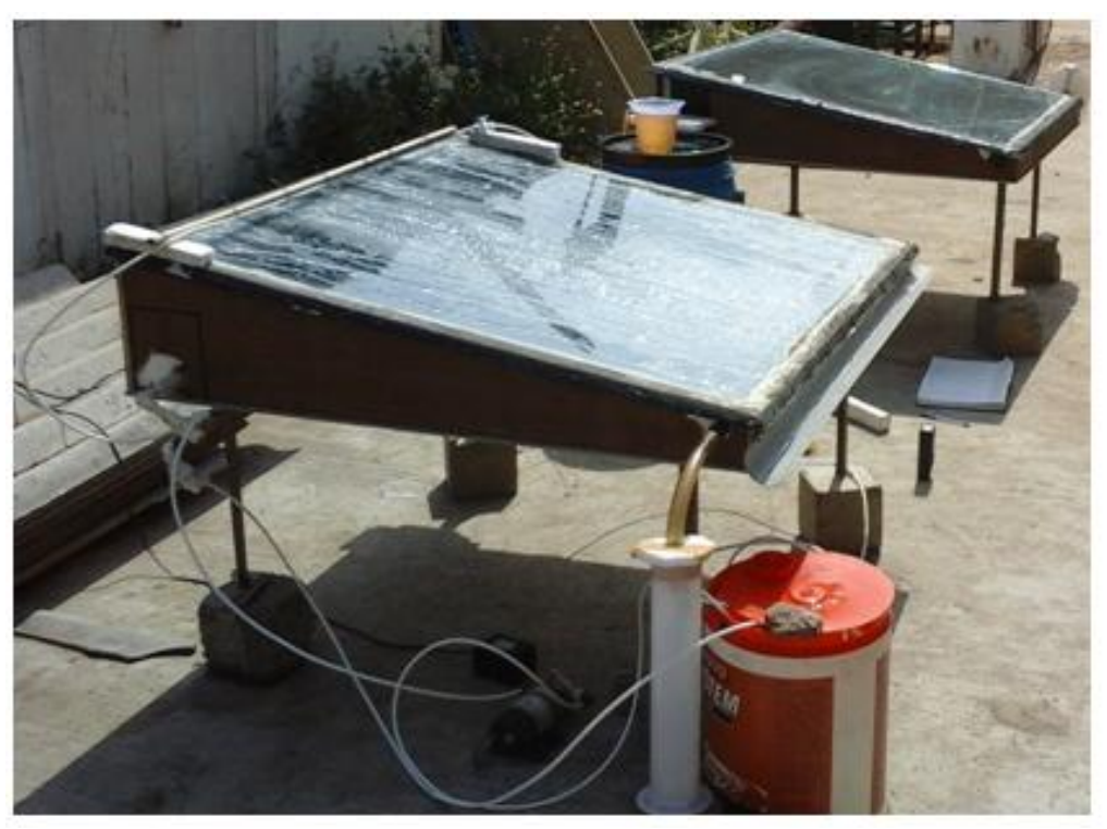
Figure 1: Experiment scheme for solar passive regenerator, with and without glass cooling

The flow rate of water was measured by collecting the water for 5 min in a container and weighing the its mass. Temperature of LD was measured with K type thermocouple whose juction were submerged in LD pool. Surface temperature of glass was also measured with a contact thermometer, K type with digital display. Ambient conditions were measured using humidity and temperature sensor, which were connected with a datalogger.