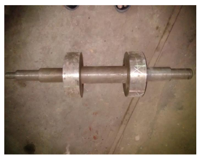
Fig. 02. Centrifugal casting machine shaft with roller (On site Photograph)