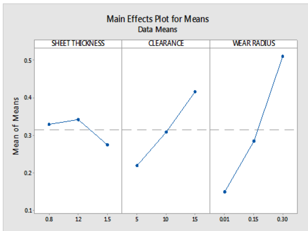
Figure -2: Graph of main effects of mean for copper sheet