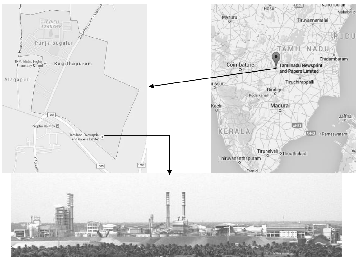
Fig.1 Location map of Tamilnadu Newsprint and Papers Limited (TNPL), Kagithapuram

Tamilnadu Newsprint and Papers Limited (TNPL), Kagithapuram, is situated at 11°02'58.7"North 77°59'46.8"East and north-west of Karur, Tamilnadu State, India. TNPL is a Government of Tamilnadu Enterprise, owns and successfully operates India's largest bagasse based integrated Pulp and Paper mill, having an installed capacity of 245,000 TPA of Newsprint and Printing & Writing paper.